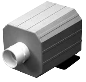
Figure 1-2: Inline Model