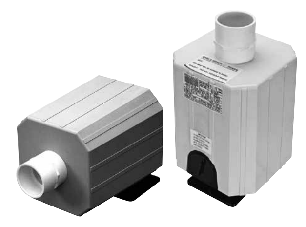
Figure 4: Inline Model blowers showing possible locations of Mounting Brackets