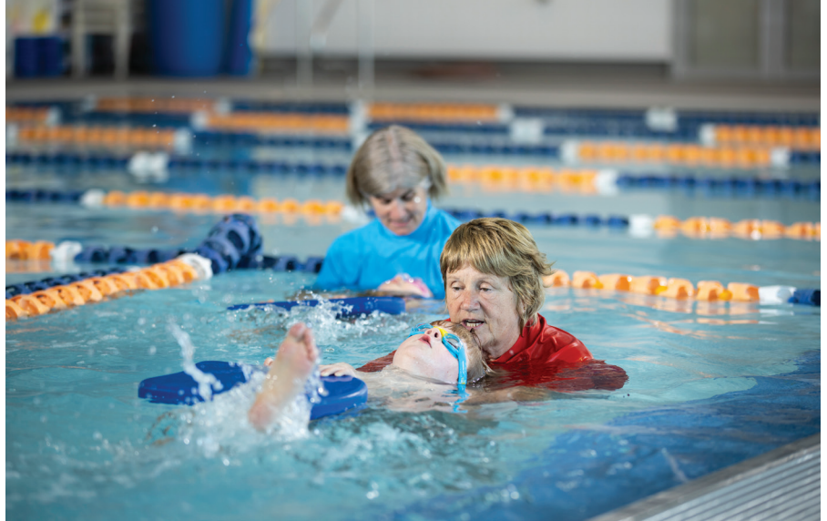
Aquagym needed a reliable, high-quality automatic controller that would help maintain hygienic water for their new 16m x 10m water babies and pre-schoolers swimming pool.